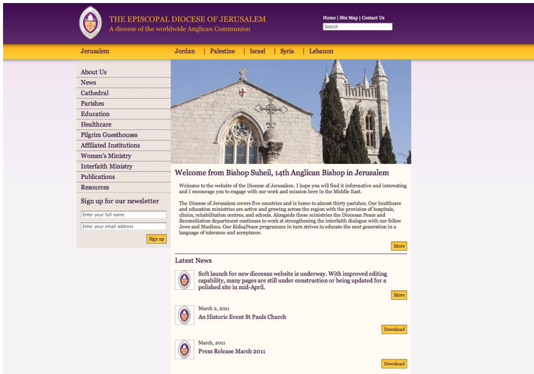
Sample home page

The main added features of the new site are regional headings, improved categorization, a clean layout and search function, and a link to a diocesan You-tube page where videos can be loaded and accessed.