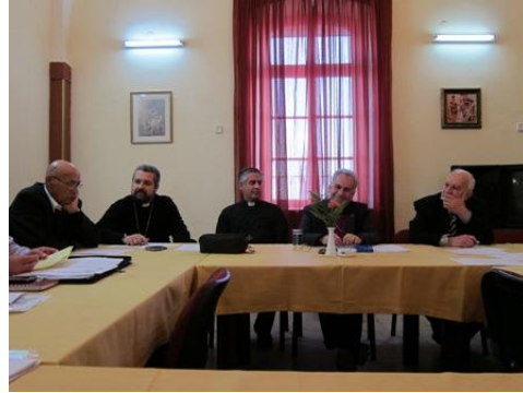
Left: Board Members of Saviour School, Zarka Right: Board Members of Christ School, Nazareth