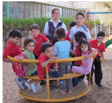
playground at the Daycare center

As we focus on home and family this holiday season, please send some joy to a child