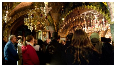
Church of the Holy Sepulchre Saturday

The World Council of Churches invites you to observe the Week of Prayer for Christian Unity THIS WEEK . An ecumenical effort in Jerusalem included Compline led by Greek Orthodox clergy at the Church of the Holy Sepulchre and a prayer service on Sunday at St. George's Cathedral. Lutherans and many other denominations are participating, and we hope you will as well in your hearts.