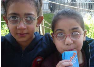
AES Irbid students

Arab Episcopal School in Irbid, Jordan has been praised for its work with blind and low vision students in addition to those with normal sight. Mainstreaming disabled students is a concept