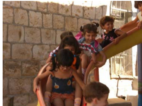
St. Philip's Nablus Nursery School

St. Paul Shefa'Amr in Israel also acquired an adjacent property which they're developing into a school for the disabled. Their progress is shown at the top of this page. Even more remarkable, the work is being done with labor, professional expertise and materials sourced locally through inkind donations and community support. The pride and sense of accomplishment is enormous. We sometimes think that the region is permanently mired in conflict and despair. The St. Paul's family is shining example of hope and growth.